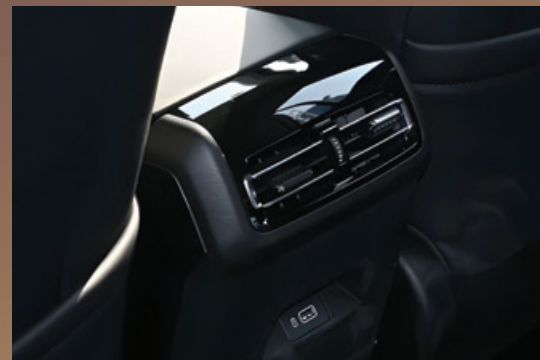
Second-Row Air Vents