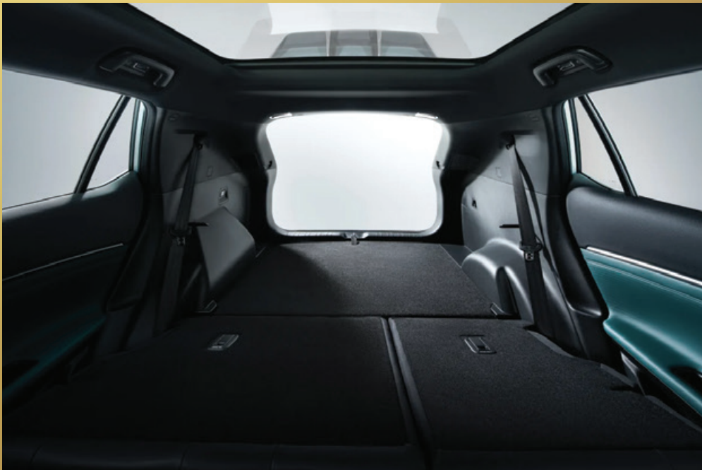
Flexible Combination Of Riding And Storage Space