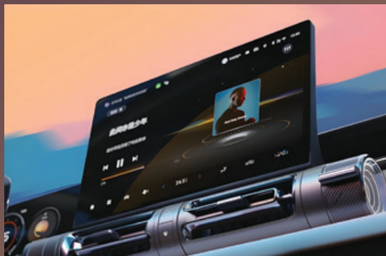
Apple Carplay & Android Mirroring