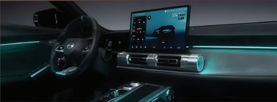
Dynamic Ambient Lights Custom Colors & Brightness