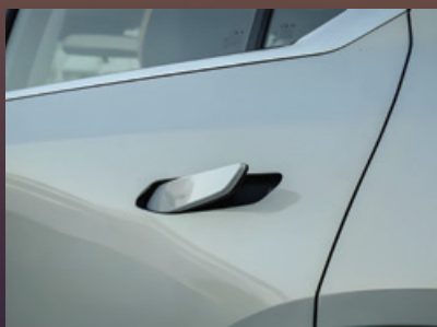
Hidden Door Handles