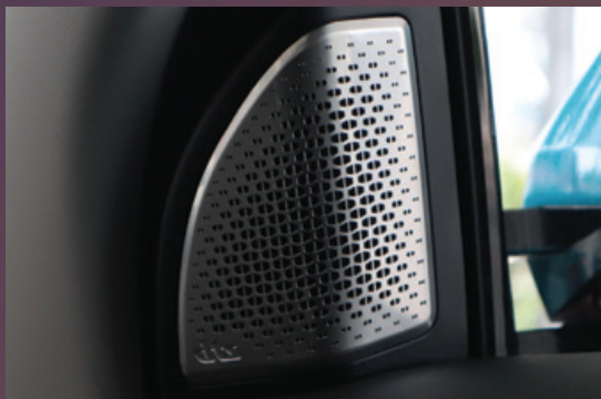
dts DTS Sound System