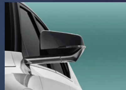
POWER SIDE MIRRORS