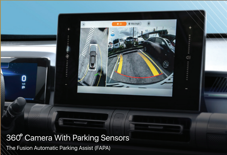
360° Camera With Parking Sensors The Fusion Automatic Parking Assist (FAPA)