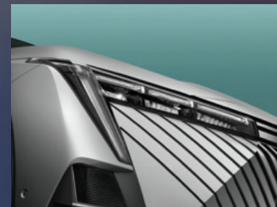
AUTOMATIC LED HEADLIGHTS