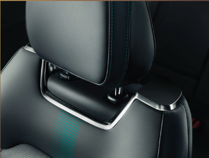
Driver Seat 8-way Power Adjustment