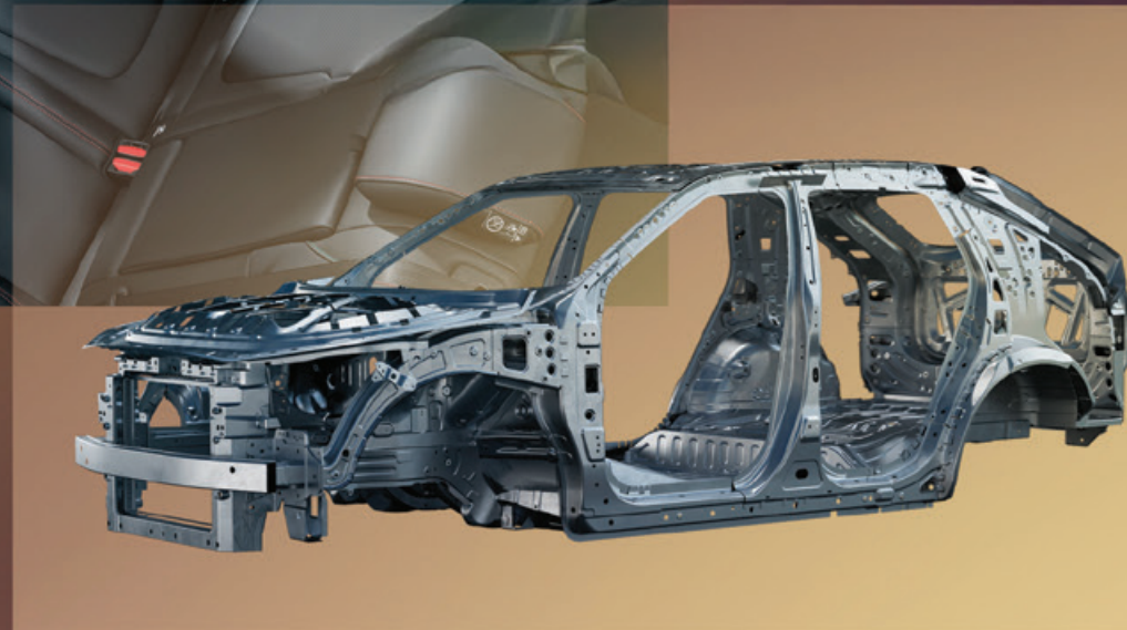
Safety Cage-Type Bodywork

The side curtain airbags have the function of holding pressure for 6 seconds, which can better protect the head and shoulders under severe impact and rollover.