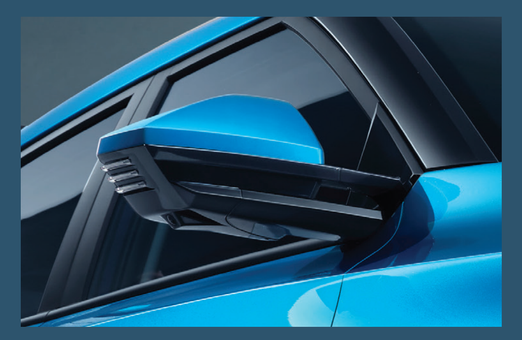
Power Adjustable Side Mirrors