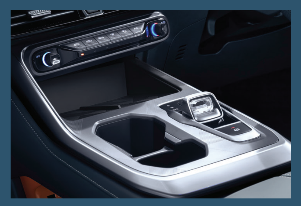
15W Wireless Charging