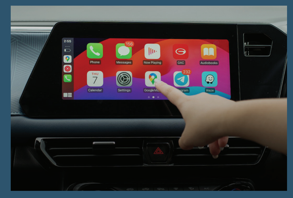
Wireless Apple CarPlay