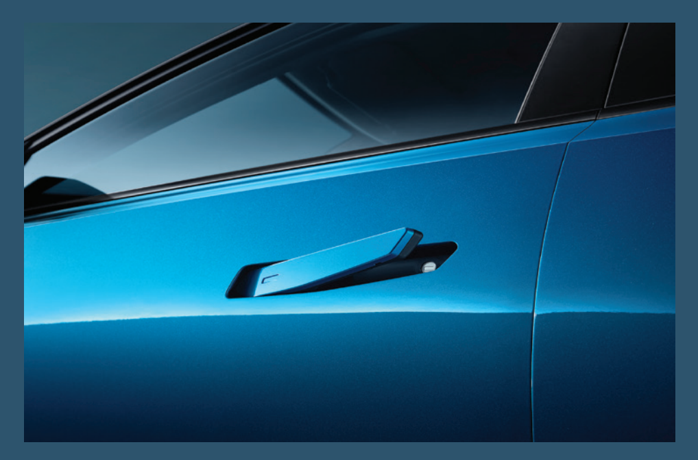
Electric Hidden Door Handles