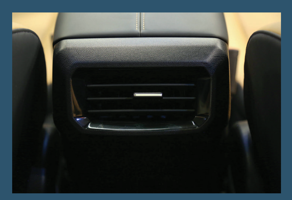
Second Row AC Vent